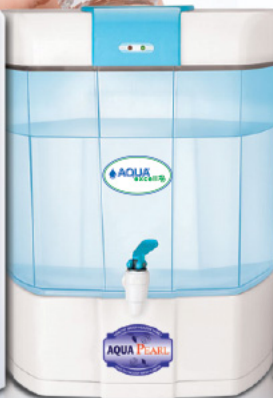
Aqua Pearl (RO+UV)