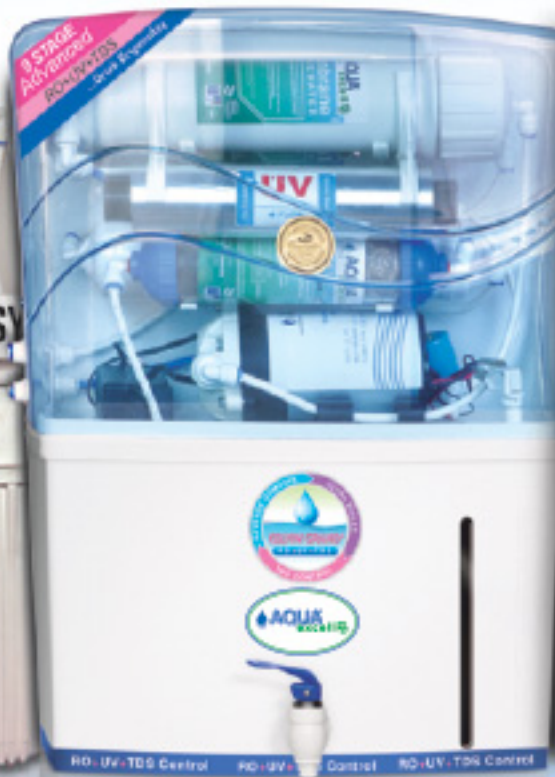
Kelvin Grand+ (RO+UV)